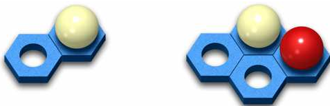
Example: A typical opening sequence

Placement Phase: White places two adjacent tiles and puts a white ball on one of them. Red places two tiles and places a red ball on one of them. Each tile after the first pair must be adjacent to at least two other tiles.