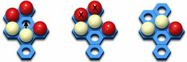
A White move that removes the last freedom of a red group to capture it

1) Ball Move: The current player must move a ball of their colour to any empty tile that can be reached by a series of steps through adjacent empty tiles (i.e. balls block other balls). Groups of enemy balls with no freedom are then captured and removed; a group has freedom if it is adjacent to at least one empty tile.