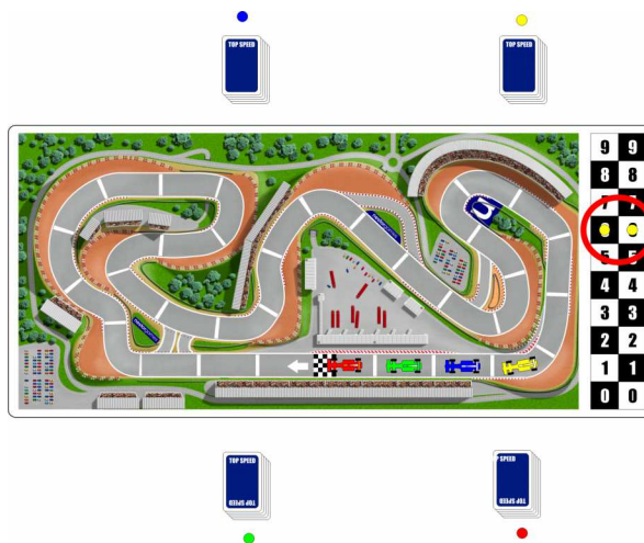
Setup example for 4 players

The 'fastest lap' markers are not used in the basic rules.