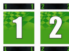
One (22 cards) and two (12 cards) movement points